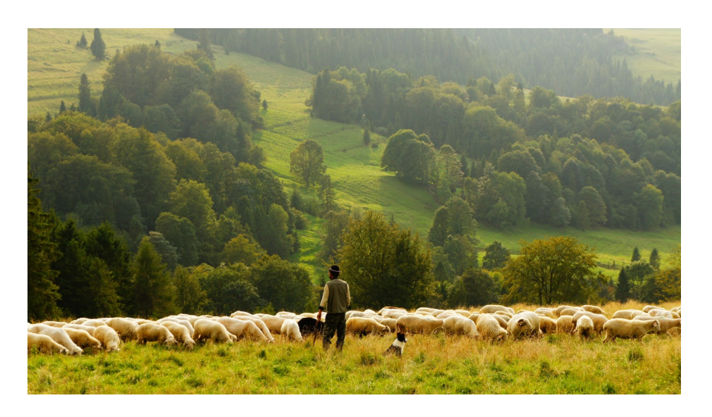
The Good Shepherd; Reflecting on John 10: 11-18